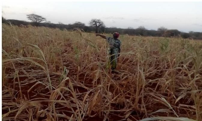
A woman standing in her field in Kenya. The maize crop has dried up as a result of the drought.

LWR has been working in East Africa since 1961 to help communities living in extreme poverty adapt to the challenges that threaten their livelihoods and well-being. LWR currently has projects in South Sudan, Tanzania, Kenya and Uganda and collaborates with local community-based organizations, church partners, and national and county government departments on programs to improve food security, livelihoods of communities, climate change adaptation and to respond to emergencies. With support from the United States Department of State Bureau of Population, Refugees and Migration (PRM), LWR and Lutheran World Federation/South Sudan are improving the protection, resilience and psychosocial well-being of children in refugee camps in Unity State and Upper Nile State, South Sudan.