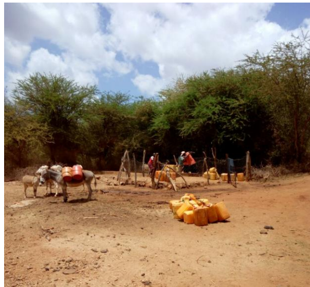
With the riverbeds completely dry, farmers in Kenya are having to work harder to find a water source. Pictured here, farmers dig deep into dry riverbeds, hoping to access at least a small amount of water.

For additional information about LWR's response to emergencies around the world, please visit lwr.org . You can also join the conversation about how LWR is assisting those affected and how you can help at facebook.com/LuthWorldRelief or twitter.com/LuthWorldRelief .