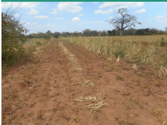
Crops in Kenya that should be ready for harvest have withered in the field due to a lack of rainfall.